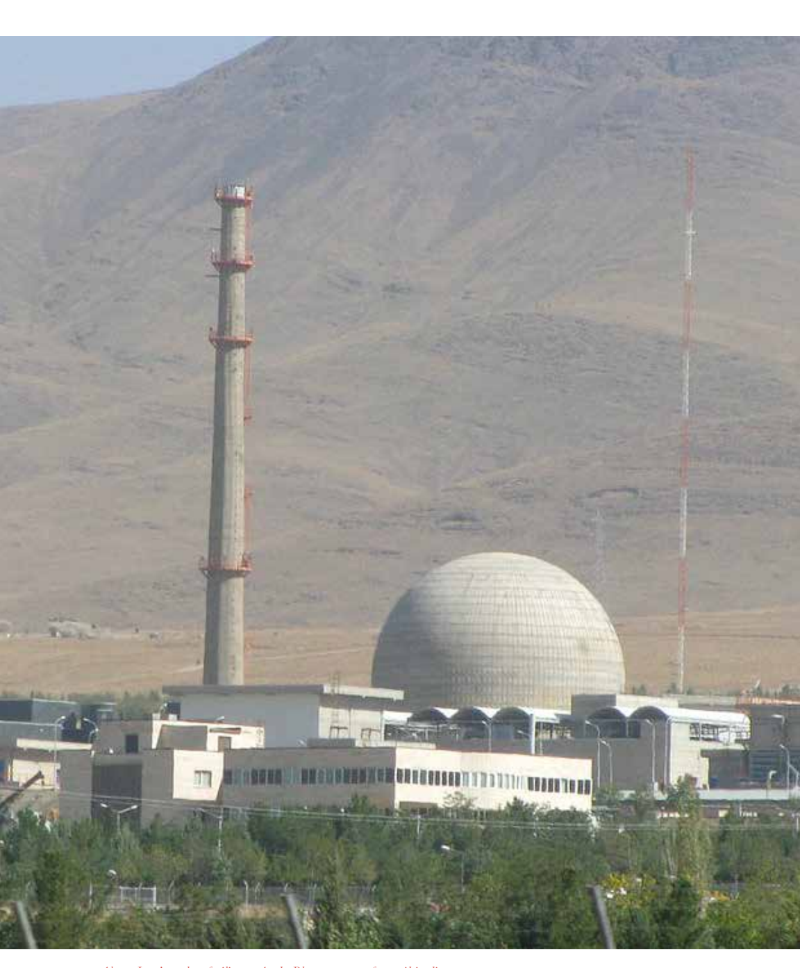
Above: Iran's nuclear facility at Arak