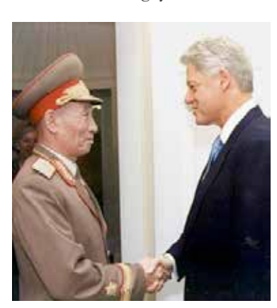
President Bill Clinton meeting with Special Envoy Vice Marshal Cho Myong-nok, First Vice Chairman of the National Defense Commission of North Korea, in the Oval Office, October 10, 2000.

In June 1994, the crisis further escalated when the Clinton administration announced that the United States would seek the imposition of multilateral economic sanctions on North Korea through the UN Security Council. As the administration reinforced the U.S. military presence in South Korea as a deterrent, the Kim Il-sung regime remained defiant, proclaiming that economic sanctions would be an act of war. To meet the North Korean nuclear challenge, the Clinton administration adopted a strategy of coercive diplomacy based on economic sanctions after considering, and rejecting, the alternative of a preventive military strike on the Yongbyon nuclear installation. The overriding concern