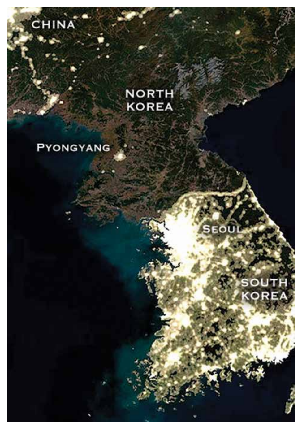
Above: Satellite view of Korean peninsula at night. The only dot of light in North Korea is the capital, Pyongyang.