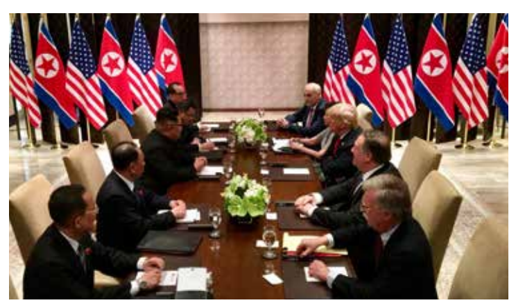
United States-North Korea bilateral meeting in Singapore on June 12, 2018

For U.S. opponents calling for a "better deal," the crux of their criticism was that the transactional JCPOA was not transformational —that it constrained but did not eliminate