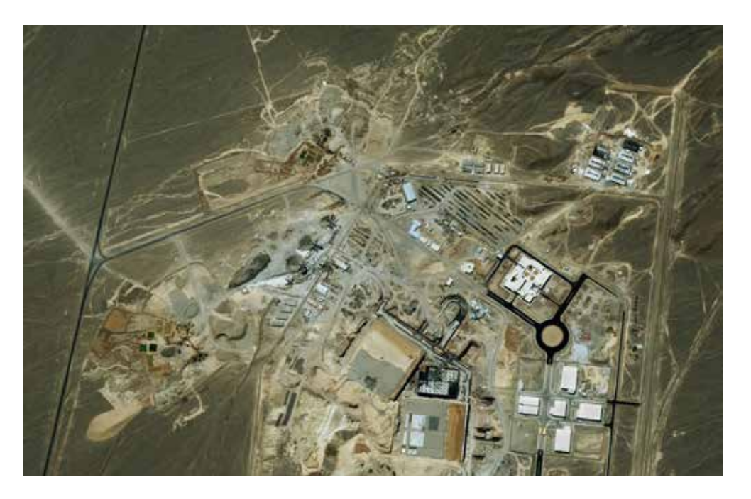
Iran's uranium enrichment facility at Natanz (aerial view)

gas, uranium hexafluoride (UF6). That gas is passed through a centrifuge and spun at high speed, with the U-238 drawn to the periphery and extracted, while the lighter U-235 clusters in the center and is collected. The collected U-235 material is passed through a series of centrifuges, known as a cascade, with each successive pass-through increasing the percentage of U-235. Uranium for a nuclear reactor should be enriched to contain approximately 3 percent uranium-235, whereas weapons-grade uranium should ideally contain at least 90 percent.