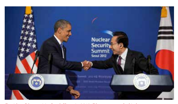
President Obama visits South Korea in 2012.

The Obama administration's approach, captured under the rubric "comprehensive engagement," was laid out more fully in its National Security Strategy of May 2010.40 The document stated that the United States sought the further development of a "rulesbased international system." It offered "adversarial governments" a structured "choice": abide by international norms (and thereby gain the tangible economic benefits of "greater integration with the international community") or remain in non-compliance (and thereby face international isolation and punitive consequences).<sup>41</sup> The Obama administration unpacked the Bush administration's mixed message, making clear its openness to a Libya-type agreement. But the adversarial states rebuffed the extended hand and refused to walk through the open door: North Korea conducted a second nuclear test in May 2009 and sank a South Korean naval vessel; Iran baulked at a proposed agreement by the P5+1 (the permanent members of the UN Security Council plus Germany) to bring the country's nuclear program into NPT compliance. Opponents of the administration's Obama's engagement strategy, turning the Bush-era criticism on its head, asked whether Obama would "take no for answer."