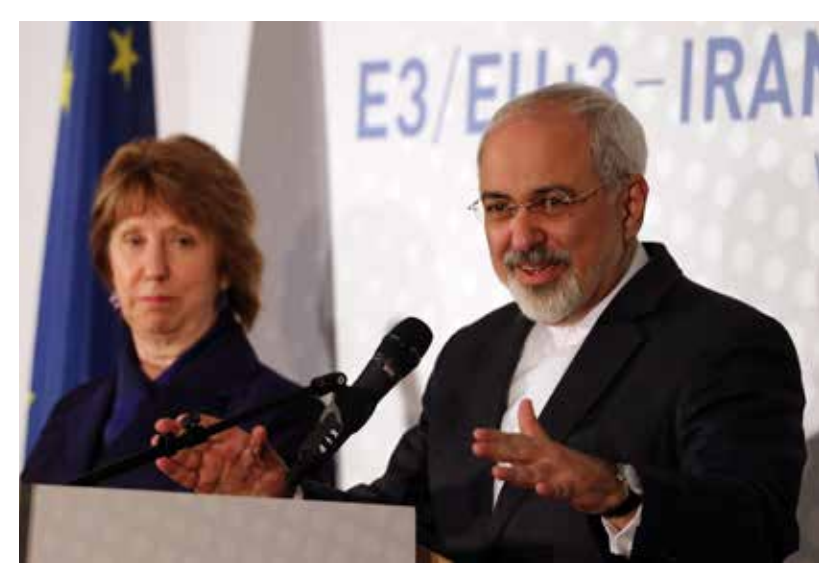
European Union foreign policy chief Baroness Catherine Ashton, left, and Iranian Foreign Minister Mohamad Javad Zarif, right, address the media after closed-door nuclear talks in Vienna, Austria, Nov. 24, 2014

The interim agreement delineated the concrete steps that the parties would carry out as they worked toward a final comprehensive agreement. For its part, Iran agreed to limitations